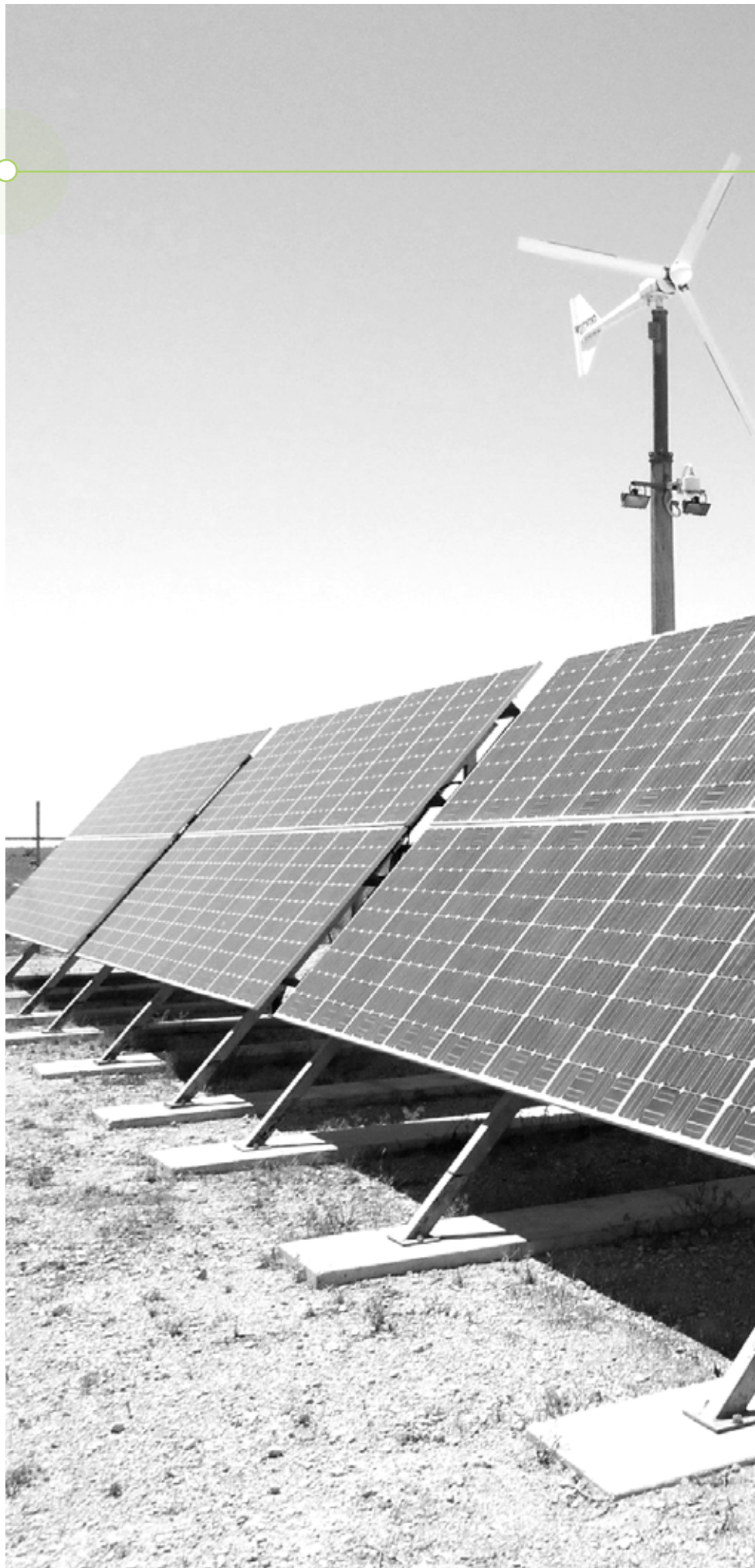
Above: One of our Solar Generation Plants, powering part of our regional network