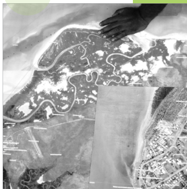
Above: reviewing and amending the proposed cable path (black line) upon feedback from elders, to create a new, jointly approved cable path (dotted line)