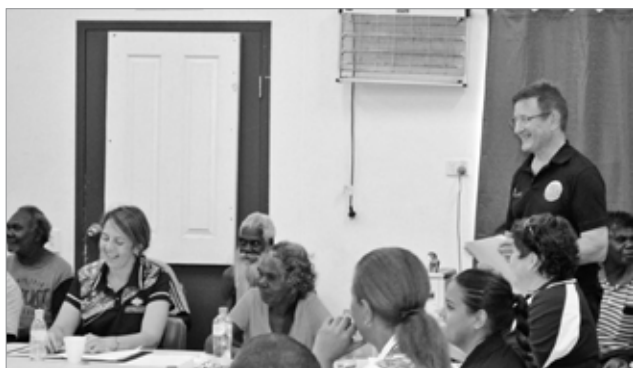
Above: Our Regulatory, Compliance and Land Access Manager during an engagement meeting

The Vocus Team looks forward to commencing cable lay in September 2019 and having the cable configured, tested and completed by December 2019.