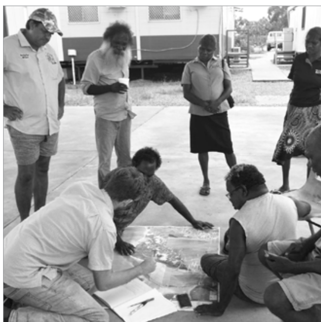
Above: Vocus team, an archaeologist consultant and local elders in discussion on the cable path

Vocus takes community feedback and amends and optimises the cable route as necessary to ensure that respect is shown to these culturally significant landmarks.