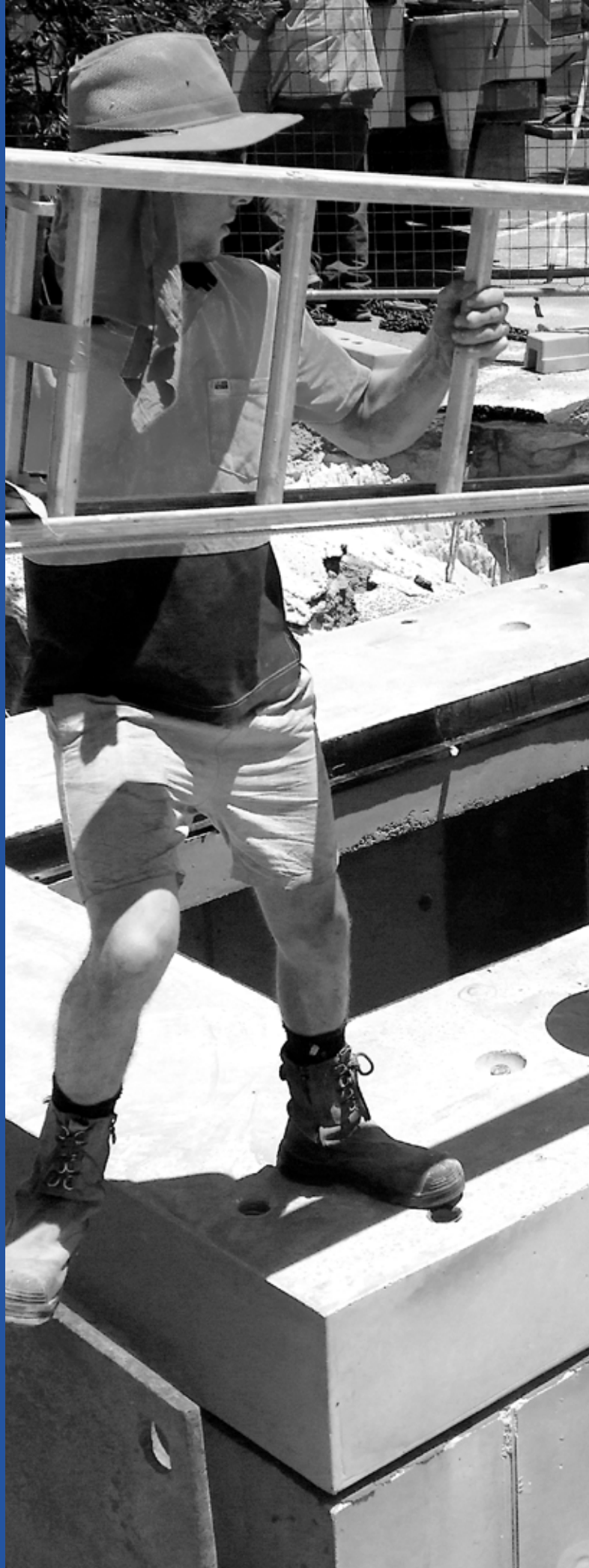
Above: ASC Perth Horizontal Directional Drill.

Through our online Learning Centre we have produced and implemented a number of compliance modules to train team members on their responsibilities and our guidelines in the areas most crucial to our operations, including privacy and information security, workplace health and safety, anti-bullying and harassment. All permanent team members are required to complete this training and it is refreshed annually.